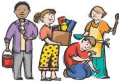
Summer of Service