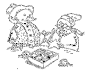
Christmas In July Party

plies, hygiene items, and other meaningful gifts. This Christmas season, a needy child overseas will receive your shoe box, along with Christian literature in his or her own language. What an opportunity to reach these children with a clear presentation of the Gospel! Watch your bulletin for more information.