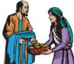
The Early Church

This month we will be learning about the early church!