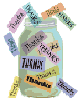
Overflowing With Thanks